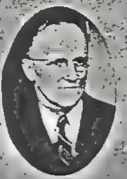
Homer Granger Hardware Retail